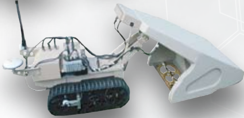
NIITEK'S VISOR™ 1050 ON FOSTER-MILLER TALON®