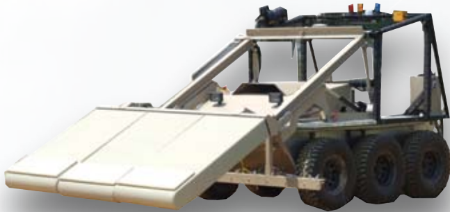
NIITEK MINESTALKER II™ WITH VISOR™ 2500