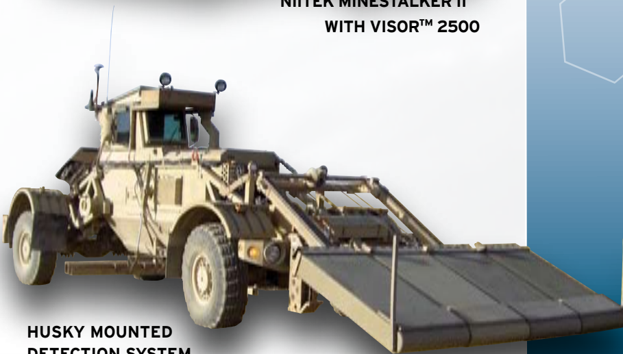
HUSKY MOUNTED DETECTION SYSTEM (HMDS) WITH VISOR™ 2500